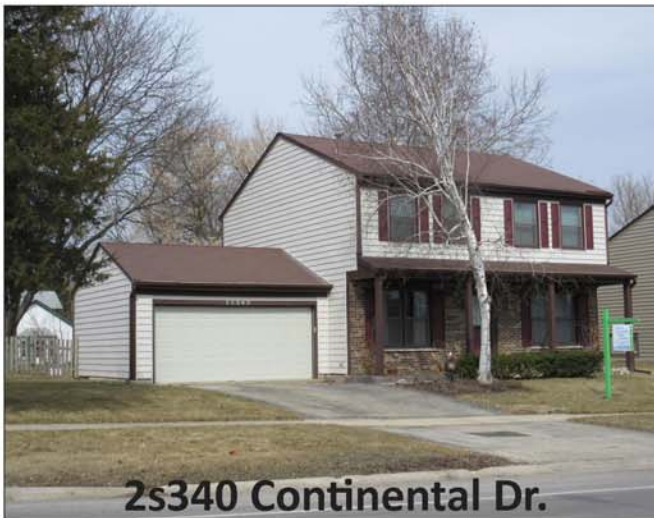
2s340 Continental Dr.